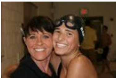
Hanging out in between events

Swimmers must be able to swim 25yds. (One length of the pool). Swimmers will be placed in groups based on ability. Beginner groups meet two nights per week and more advanced groups meet three to five nights per week. In addition to practice there will be about 5 swim meets throughout the season. Meets are generally held on Saturday or Sundays. Competitions end the last week in February but swimmers are invited to continue practicing until the last week in March.