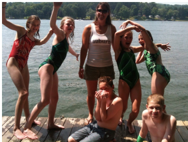
After meet fun